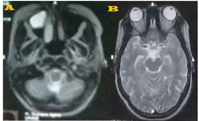
Figure 1. Axial section of cerebral MRI in T2 sequence showing partial filling of the right maxillary sinus (A). Thickening and widening of the left cavernous compartment enhanced by paramagnetic contrast (B).

The prognosis was affected by the occurrence of cardiorespiratory arrest two days later while the patient was undergoing surgery.